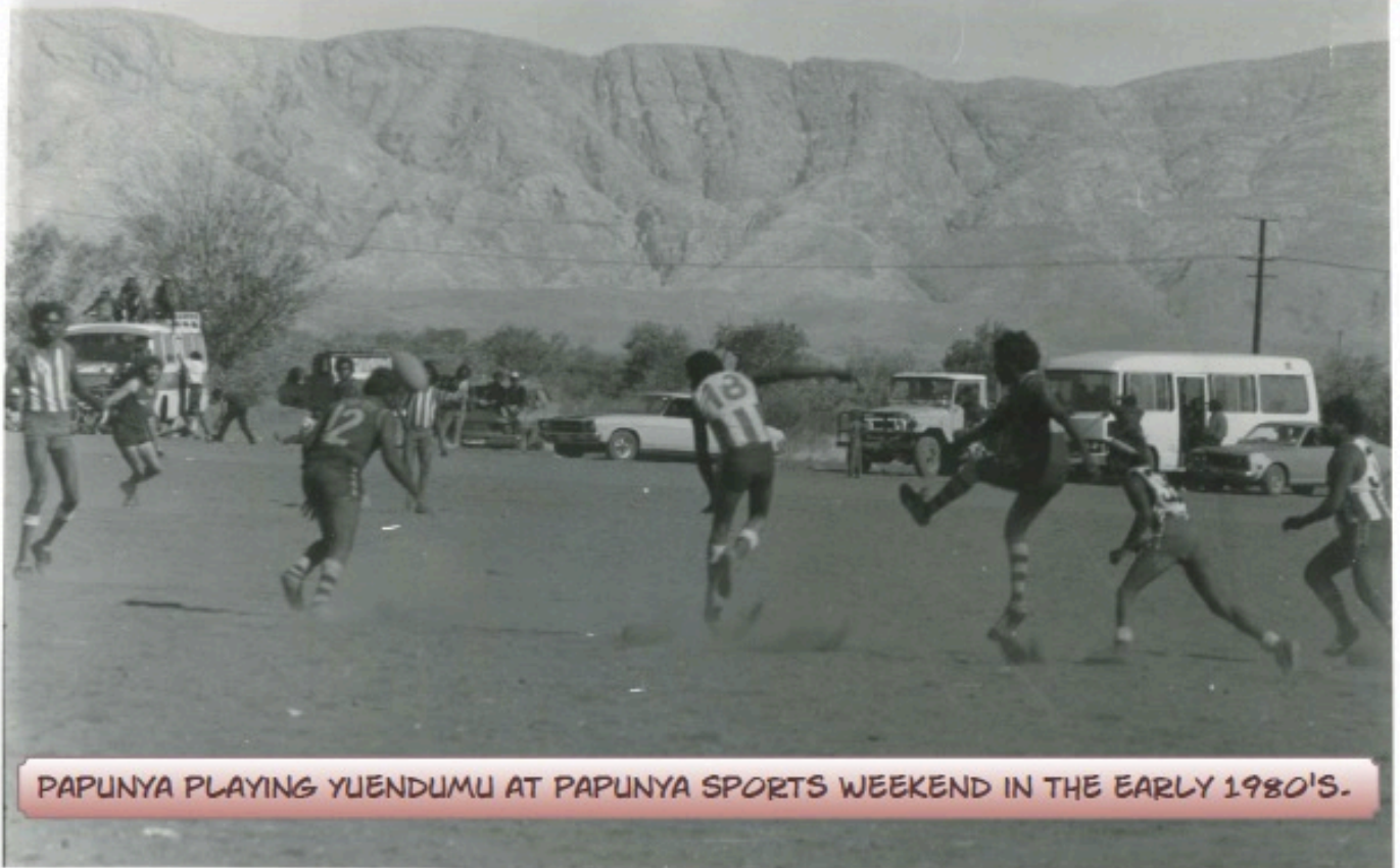
PAPUNYA PLAYING YUENDUMU AT PAPUNYA SPORTS WEEKEND IN THE EARLY 1980'S.

THE WILURRARA TJUTAKU FOOTBALL LEAGUE (WTFL) WAS SET UP SO REMOTE ABORIGINAL COMMUNITY PEOPLE IN THE SOUTHERN N.T. COULD PLAY AND WATCH AFL GAMES IN THEIR HOME COMMUNITIES INSTEAD OF HAVING TO TRAVEL INTO TOWN.