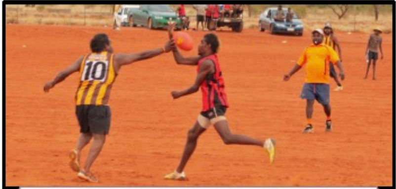
KINTORE HAWKS AND PIKILYI BOMBERS PLAY