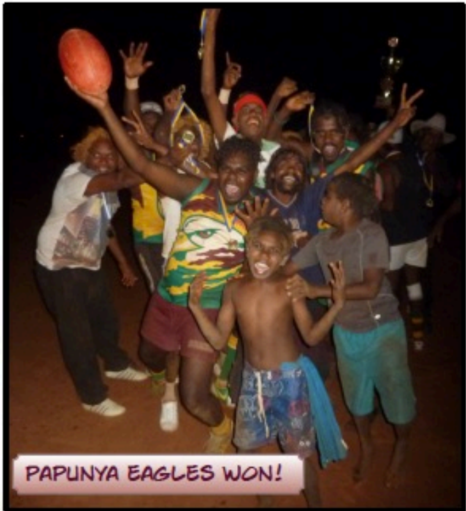
PAPUNYA EAGLES WON!