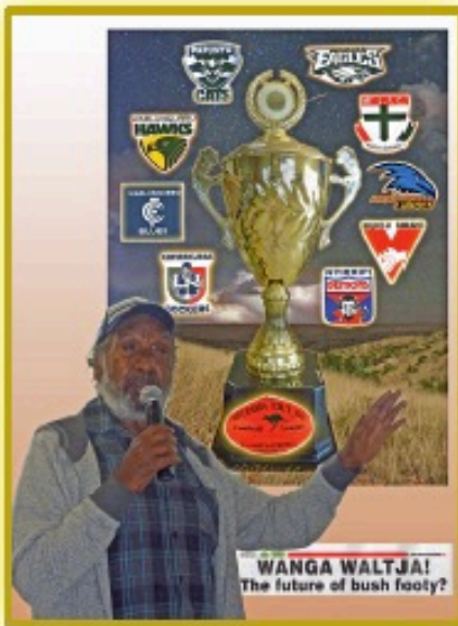
WANGA WALTJAI! The future of bush footy?