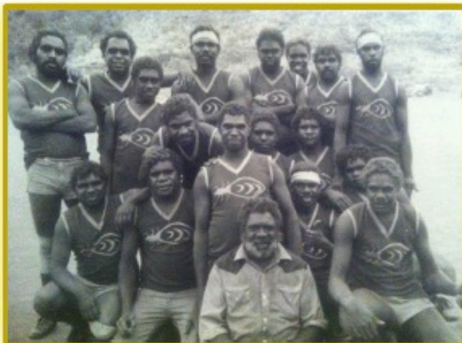
THIS IS THE MIGHTY PAPUNYA EAGLES IN THE 1980'S

COMING INTO ALICE SPRINGS TO PLAY AND WATCH FOOTBALL IS EXPENSIVE AND DANGEROUS FOR REMOTE COMMUNITY MOB. IT'S HARD TO FIND SOMEWHERE TO STAY, CARS AND ROADS ARE IN POOR CONDITION, FUEL COSTS ARE HIGH, AND DISTANCES ARE BIG. LOTS OF PEOPLE GET STUCK IN TOWN. THERE'S TOO MUCH GROG IN TOWN. TOO MANY PEOPLE END UP IN HOSPITAL, IN CUSTODY, AT COURT, AND IN JAIL.