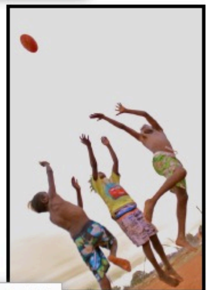
THE KIDS PLAYED THEIR OWN GRAND FINAL